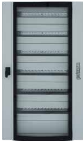
CPD Surface Distribution Cabinets with Din Rail Accessory