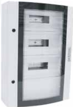
CPD Surface Mounting Distribution Cabinets with Din rail Accessory + Blank Cover