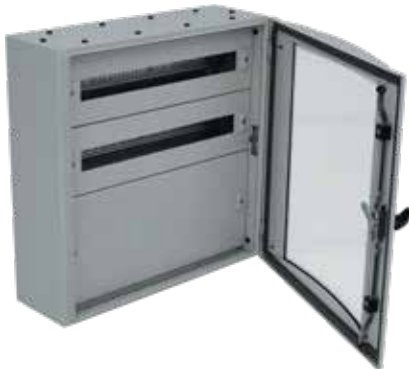
CPD Surface Distribution Cabinets with Din Rail Accessory + Blank cover h:200 mm