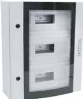
CPD Surface Distribution Cabinets - with Din Rail Accessory