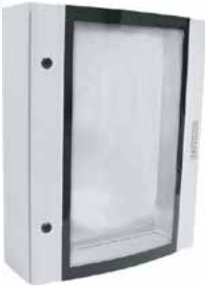
CPD - Surface Mounting Distribution Cabinets - with mounting plate